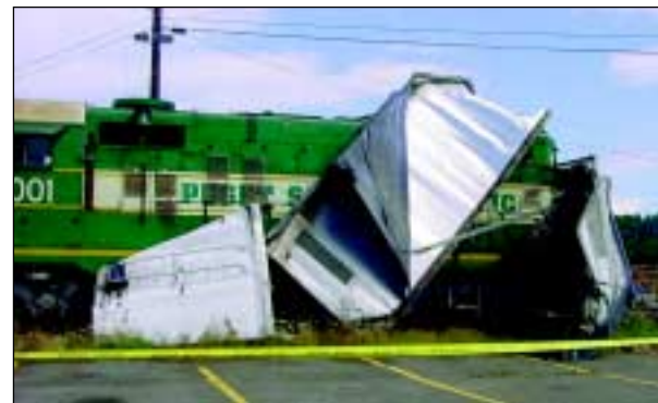
No one was injured on August 6 when a runaway Puget Sound & Pacific locomotive and several cars crashed into a tractor trailer before coming to a halt just outside of a lumber mill in Shelton, Wash. The PS&P is the second Rail America subsidiary to endure a major remote control accident in the past two months. On September 17, a UTU member on the California Northern Railroad lost his leg in a remote control accident.

On August 6, a remote control accident took place on another Rail America subsidiary, the Puget Sound & Pacific in Shelton, Wash. In that instance, a runaway remote control locomotive and several cars rolled downhill for three miles before colliding with a tractor trailer at the entrance of a lumber mill. No one was injured. •