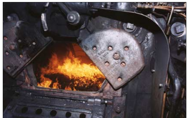
Heat generated by coal in the firebox boosted temperatures to more than 117 degrees Fahrenheit inside the cab.