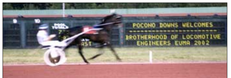
BLE members enjoyed a "Night at the Races" at the Pocono Downs racetrack.