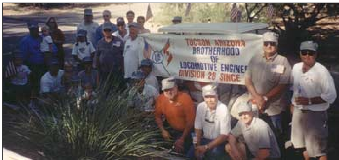
Members of BLE Division 28, along with members of GIA "Guadalupe" Auxiliary 28, participated in the annual Tucson, Ariz., Labor Day parade.