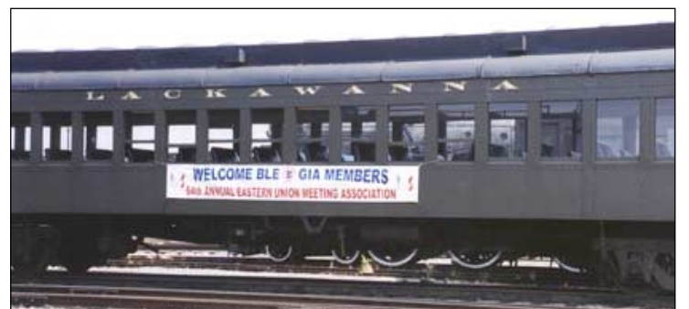
The passenger car used by most BLE members on the trip.