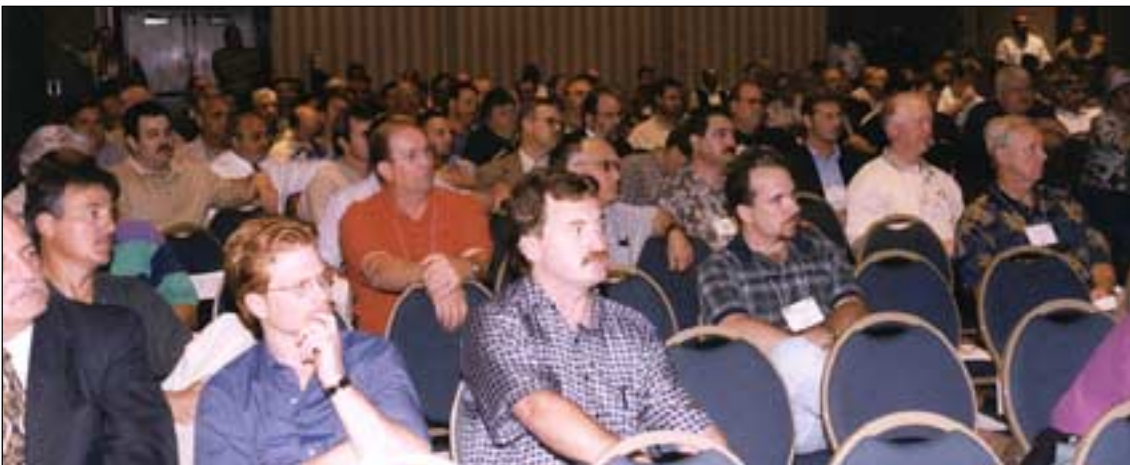
BLE members during Tuesday's closed session.