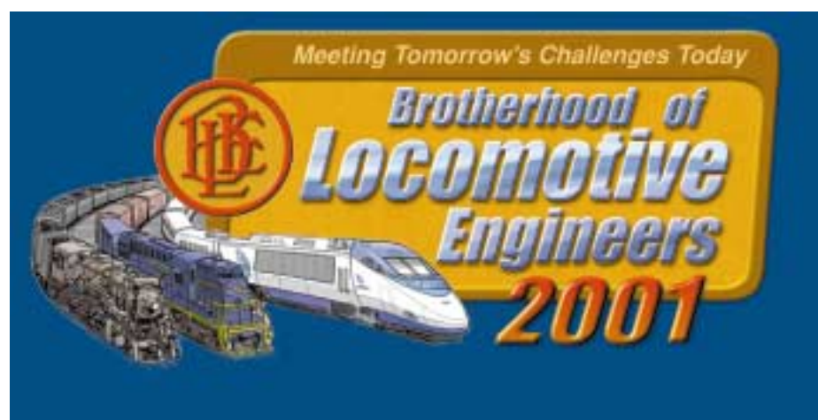
Official logo for the BLE's Seventh Quinquennial International Convention

The International Convention, held once every five years, will take place at the Fontainebleau Hotel in Miami, Fla., from September 24-28, 2001. •