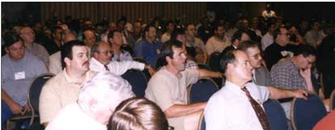
BLE members during Tuesday's closed meeting.