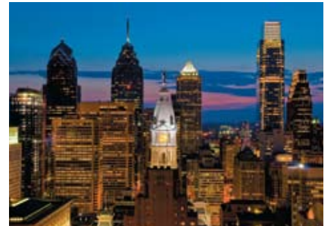
A dramatic evening sky view of Philadelphia highlights the contrast of new and old living side by side.

One of the tours planned will include the Camden Adventure Aquarium (which