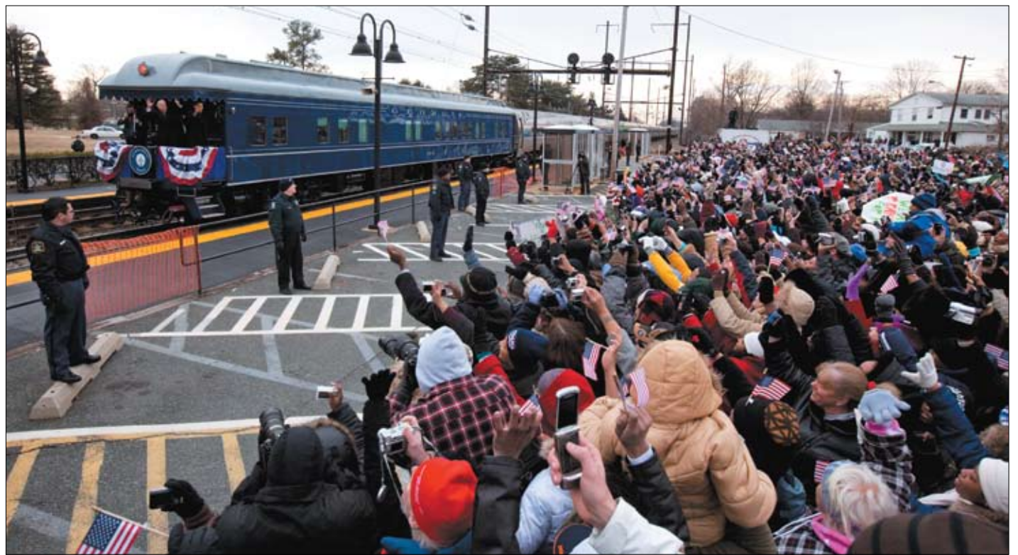
Huge crowds camped out along the route from Philadelphia to Washington, D.C.

"I was jumping up and down when I found out."