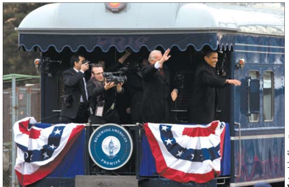
Media focus was overwhelming for Vice President Joe Biden and President Obama.

Obama's train during a campaign swing earlier in 2008, and he and his entire crew were chosen for the chase train.