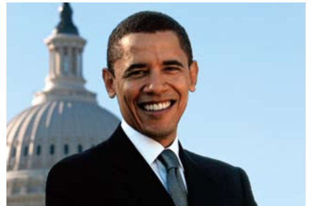
BLET engineers pilot the Obama Express to historic inauguration. pg.4