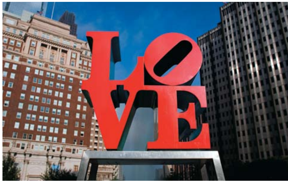
Robert Indiana's iconic Love sculpture is located in at JFK Plaza across from City Hall. It was installed in 1976, and its location, JFK Plaza, is now better known as Love Park.

Those who get to town early for the July 4 weekend (July 2, 3, 4) will enjoy Philadelphia's "Welcome America" celebration, which includes free concerts and fireworks on the waterfront, imme-